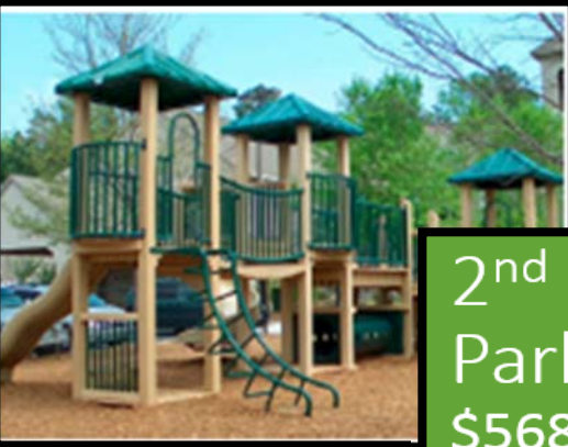
2nd Street Park $568,000