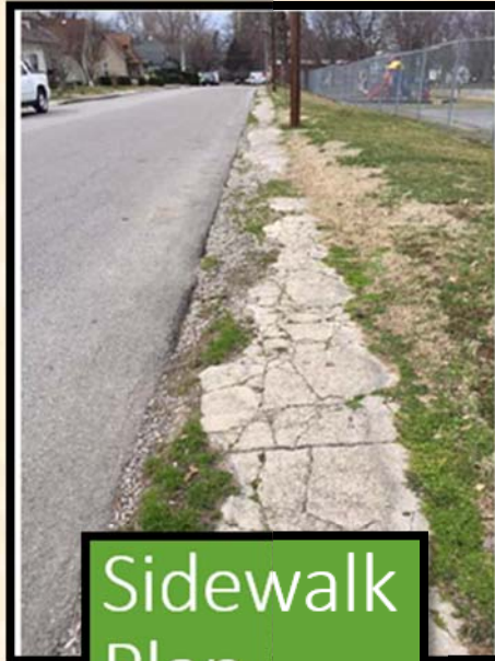
Sidewalk Plan $1,268,000