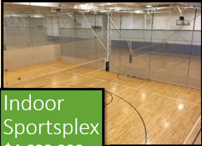
Indoor Sportsplex $4,608,000