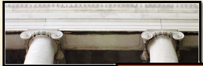
Ag Expo $7,000,000 est.