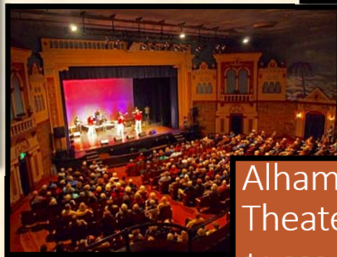
Alhambra Theater $1,000,000