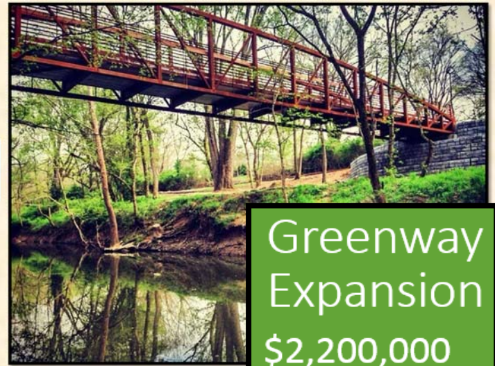
Greenway Expansion $2,200,000